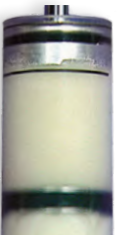
Non-pressurized shock, foaming

In a monotube gas pressure shock absorber, the nitrogen is separated from the oil by a dividing piston. This keeps the oil column under pressure at all times to prevent the release of gas molecules while enabling the shock to deliver consistent performance under all driving conditions.