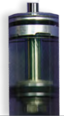
Gas pressure shock, no foaming