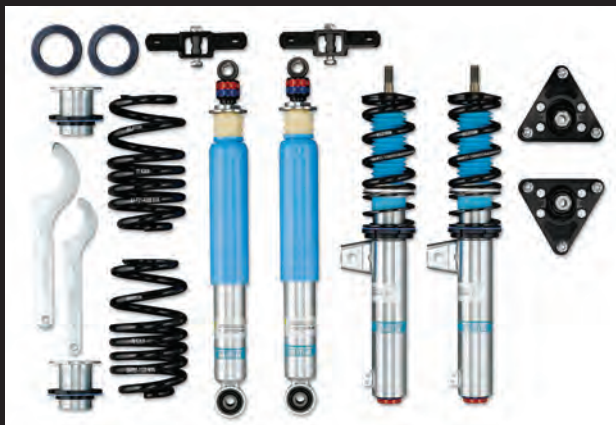
Volkswagen Golf VI Clubsport system shown above

The BILSTEIN Clubsport is the ultimate coilover suspension system for use on both the road and race track. Every system is a complete package designed and engineered for the specific vehicle application.