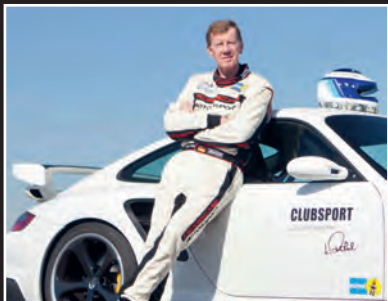
Tested with World Champion Walter Röhrl on Nürburgring-Nordschleife: Approved by Walter Röhrl

The two-way damping adjustable system, complete with integrated reservoir, provides the necessary weight-saving advantage for racing and clubsport use as compared to systems with external reservoirs. Independent rebound and compression damping can be easily adjusted by the two motorsports proven aluminum adjustment knobs, even when mounted on the vehicle. Ten positive detent adjustment positions for both compression and rebound allow the setup to be changed quickly and precisely. With the 10 x 10 clicks, a wide range of handling characteristics can be dialed up in just seconds, for instant back-to-back set-up and testing. In combination with the supplied adjustable uniball camber plates, you can select the right setup for each track, weather conditions and vehicle weight. Driver feel and tire characteristics can also be changed using the camber adjustment and the 100 possible damping settings.