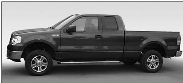
AFTER: With Bilstein 5100 Series Front Height Adjustable Leveling Shocks installed