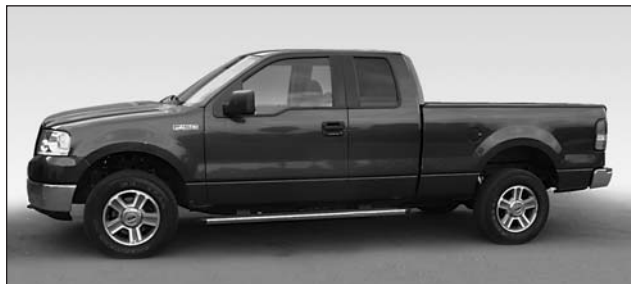
BEFORE: Stock suspension with factory "rake"