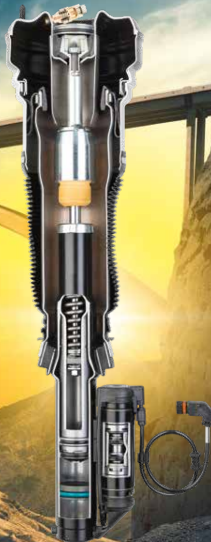
Figure: BILSTEIN B4 air suspension module for Mercedes-Benz S-Class W220.

Only BILSTEIN B4 air suspension modules provide the perfect replacement solution for your vehicle – manufactured in true original equipment quality.